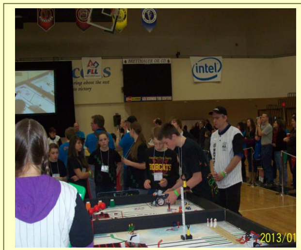
The Gearsters Team in Portland at the Lego Robotics Competition on January 19 th , 2013. The team received a $500.00 Scholarship for each year they attend EOU at the local competition.